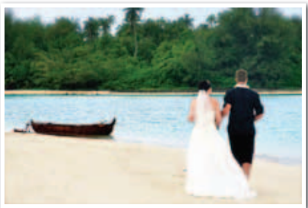
Our pacific setting...