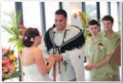
Our indoor lounge...