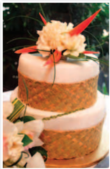
A pacific flavour ....!