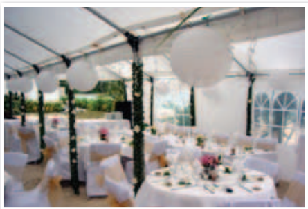
Our beachside marquee...