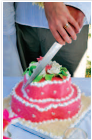
Add some colour...!