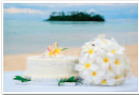
Round cake with fondant icing...!

These weddings cakes range from $145.00 upwards.