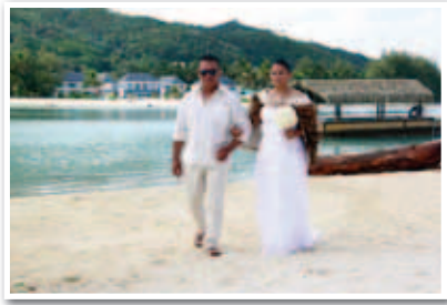
Our pacific setting...